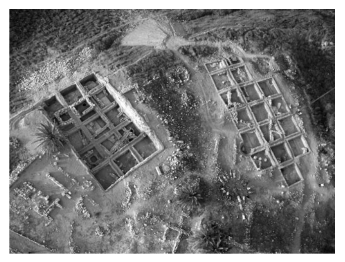
5. Overhead of Areas K and Q at Megiddo, end of the 2008 season. The use of Kenyon-Wheeler 5m x 5m squares in a grid pattern, with one-meter-wide balks between, can be clearly seen.

allowing the stratigraphy of the site to be examined and reexamined as necessary, not only by the original excavators but by subsequent archaeologists as well.